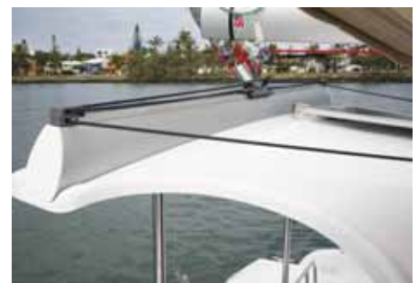
This is what it is all about for this couple, getting away from it all – and enjoying the moment. (top)